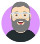
Harold Kent Set Builder