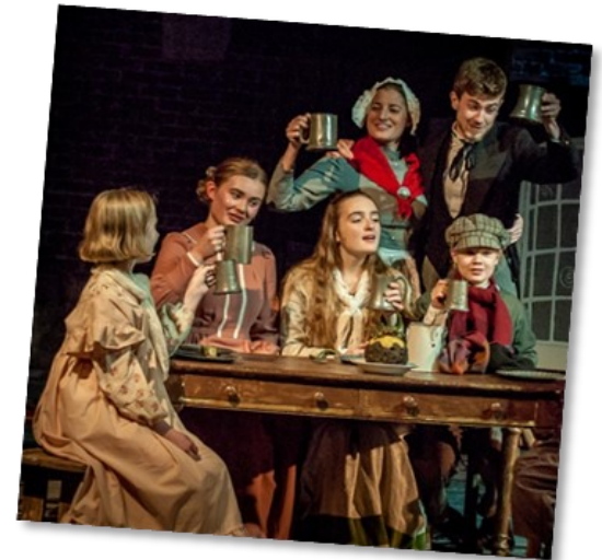
A Christmas Carol

We're also a warm and welcoming place to volunteer. On our web site you'll find out about how you can become part of our friendly group, whether on stage or behind the scenes. Take a look and see what appeals. No experience is necessary and you could make some good friends as well as picking up new skills!