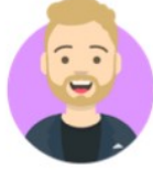
Cris Pinhouse Actor